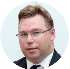
Marko Pavic Member of Parliament, European Affairs Committee European People's Party, EPP