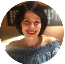
Tana Foarfa Staff