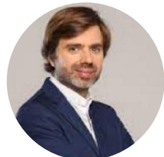
João Pinho de Almeida

Member of Parliament, Comissão de Assuntos Europeus