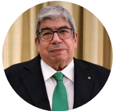
Eduardo Ferro Rodrigues

President of the Assembleia da República