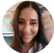
Hara Parla Staff